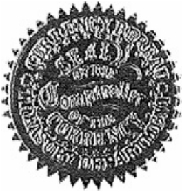
Comptroller of the Currency

IN TESTIMONY WHEREOF, today, December 6, 2018, I have hereunto subscribed my name and caused my seal of office to be affixed to these presents at the U.S. Department of the Treasury, in the City of Washington, District of Columbia